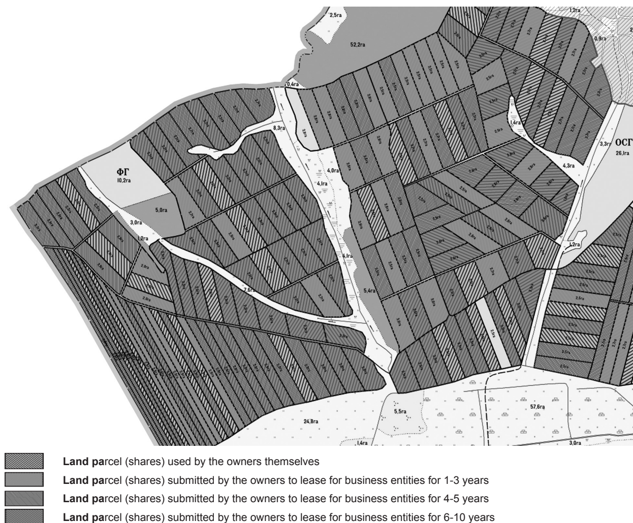
Fig. 2. Conditions of lease relations within the territory of Yaskivtsi village council, Derazhnia district, Khmelnytskyi region, established according to the results of the land reform.

completion of crop schemes' order in crop rotation; the projection of crop rotation fields; the development of a plan for the transition to a relevant crop rotation; and the conversion of the projected fields of crop rotation into real terms (on location).